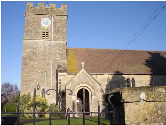
9.00am Chapel of Ease, Bredon's Norton

The church services this week will be at: