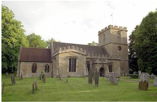
10.30am St Mary's, Elmley Castle